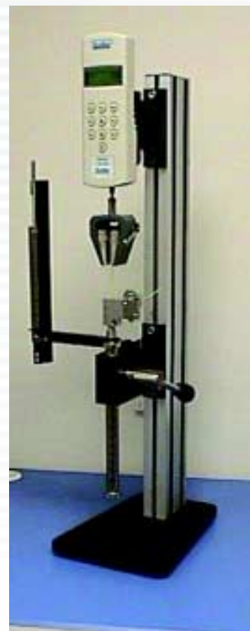
MT150L Lever Actuated Tester with optional Ruler Assembly. Shown with optional DFT Force Gauge. Order gauge separately.