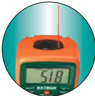
InfraRed Thermometer with built-in laser! (Patent Pending)

No cables or probes to connect, break or lose.