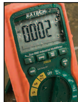
Waterproof feature protects meter when taking a measurement in a wet environment